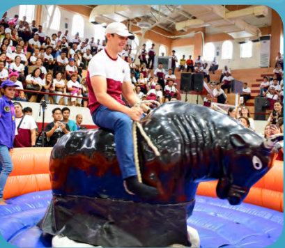
Bull Ride (₱150)