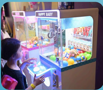
Claw Machine (₱50)