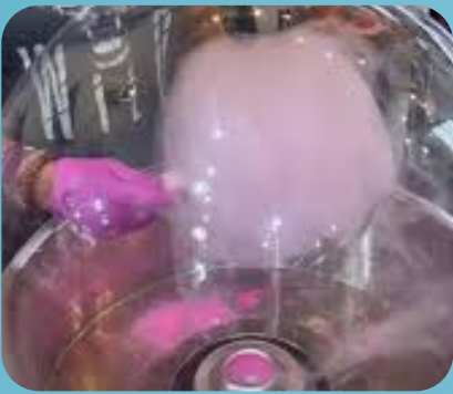
Cotton Candy (₱50)