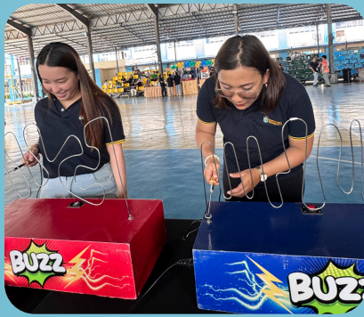
Buzz Wire (₱50)