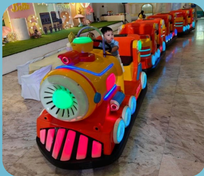
Trackless Train (₱50)