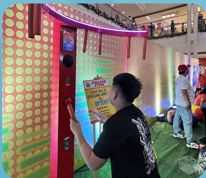
Falling Sticks (₱50)