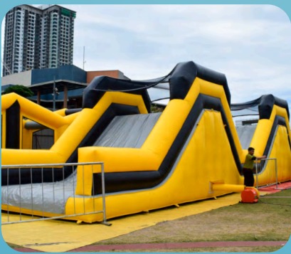
Obstacle Course (₱100)