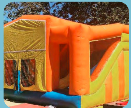
4-in-1 Combo (₱50)