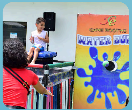
Dunk Tank (₱100)